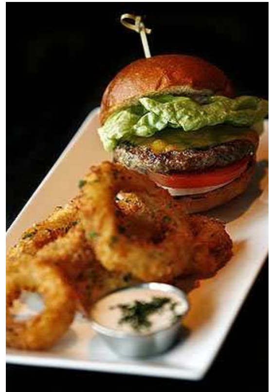
The Classic Burger, a ketchup infused bun, butter lettuce, vine ripe tomato, house pickle onion and secret sauce served with onion rings at "the crow bar and kitchen" in Corona del Mar.

As you begin to make your choices, be sure to check out